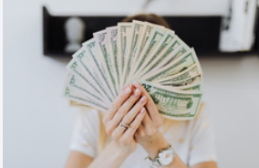
Proof of income