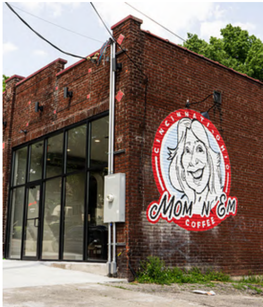
MOM 'N' EM