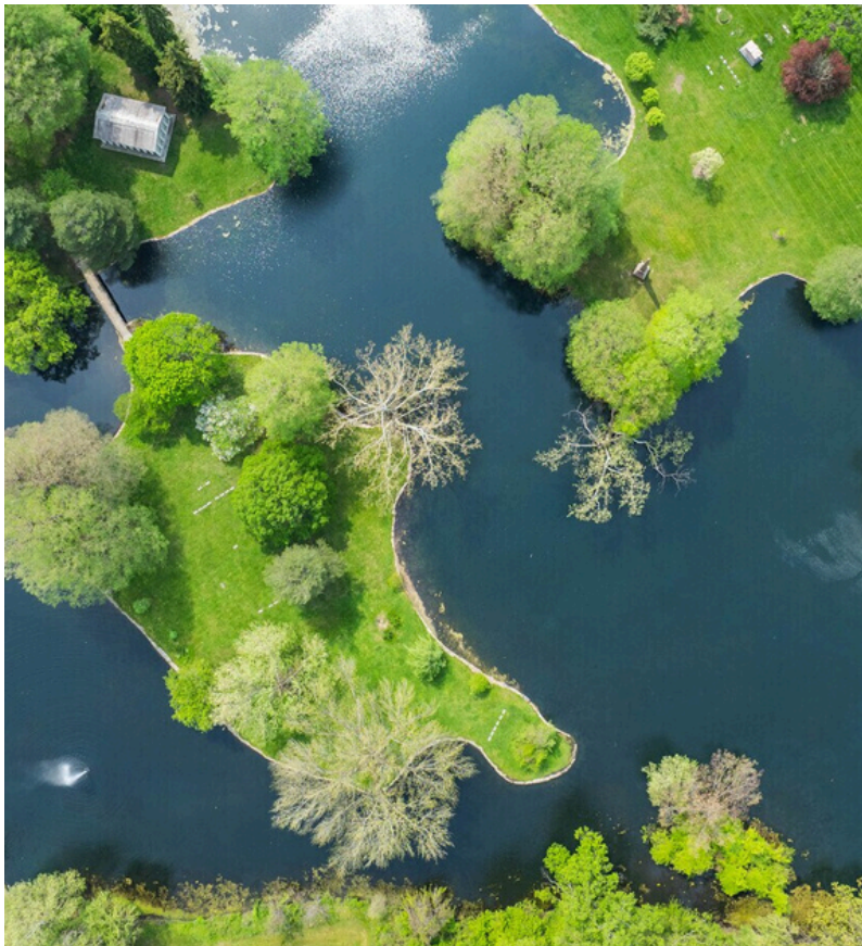
SPRING GROVE VILLAGE