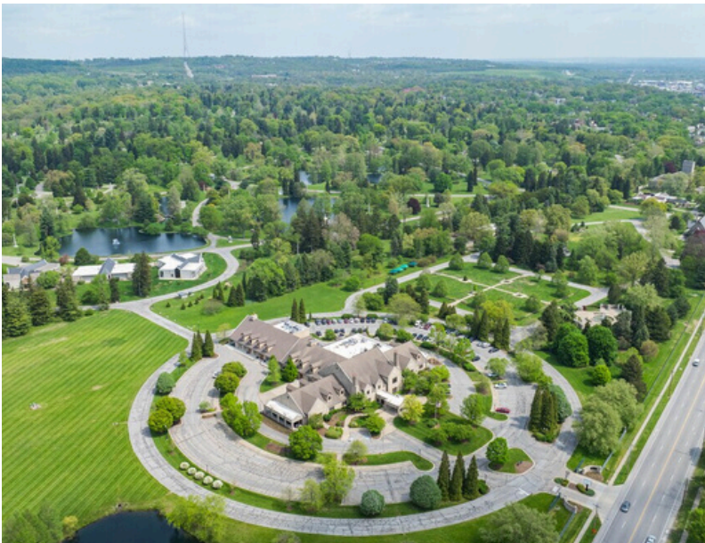
Tucked just north of downtown, Winton Hills and Spring Grove Village offer a peaceful, green escape with easy access to I-75 and the city core.

Spring Grove Village is known for its historic homes, diverse community, and proximity to the stunning Spring Grove Cemetery & Arboretum. You'll find a mix of charming older homes, lots of green space, and easy access to downtown. It's a great fit if you're looking for a quiet, established neighborhood with character.