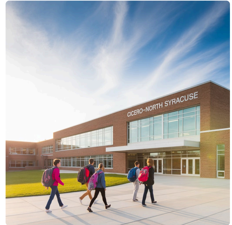
C-NS High School

Families relocating often choose Clay for strong school options and a balanced student experience.