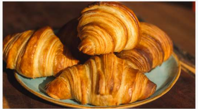
TABLE AU PAIN

Bella's Table is the newest "Table" restaurant and serves delicious Italian food. They also have many gluten free options . www.bellastable.com