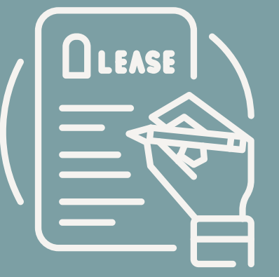
Full compliance with GA & SC Landlord-Tenant Laws

Marketing Fee: 1/2 of proposed rent for each new tenant Management Fee: 10% of tenant's monthly rent