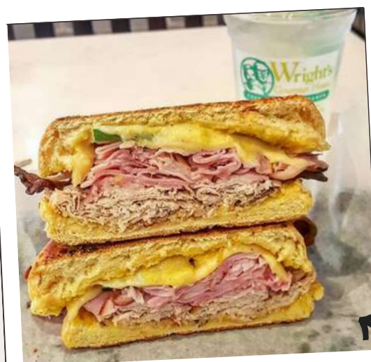
my favorite sandwich shop Wrights Gourmet House

CONVENIENTLY LOCATED TO TAKE MINI TRIPS TO OTHER CITIES