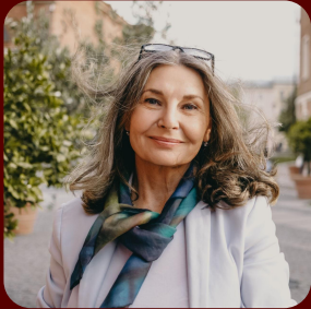
Full Name Title