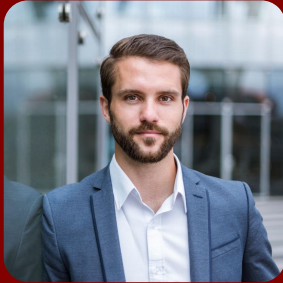
Full Name Title