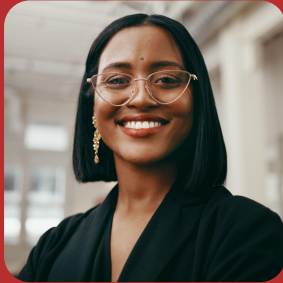
Full Name Title