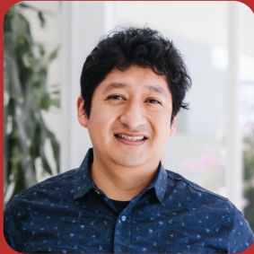
Full Name Title