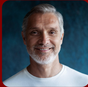
Full Name Title