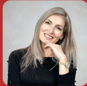
Full Name Title