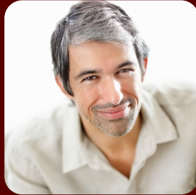
Full Name Title