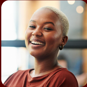
Full Name Title