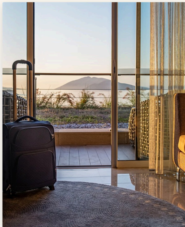
TWO NEW HARBOR-VIEW HOTELS BY 2028

It is the more refined of the two, designed around the harbor's boating history, with artwork and photographs woven through the property that reach back to the days when traders threw hides off the Headlands bluff to the ships below. Its rooftop restaurant and lounge will be called Headlands, with a restaurant, an outdoor lounge, and views across the harbor and toward the ocean.