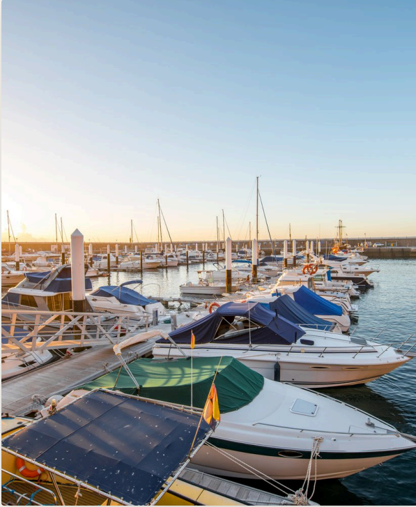
THE MARINA, MORE THAN TWO-THIRDS BUILT