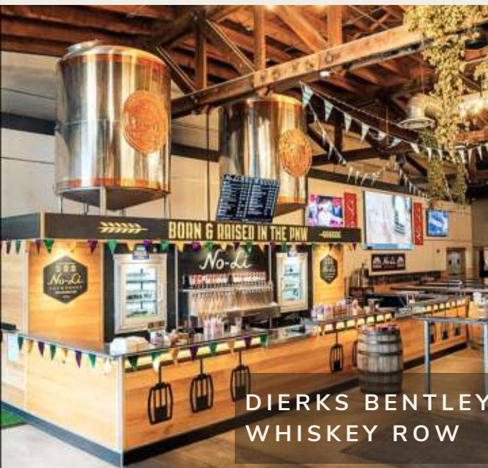
DIERKS BENTLEY'S WHISKEY ROW

If you're looking for a fun night out with great drinks, live music, and a little two-steppin', Dierks Bentley's Whiskey Row in Downtown Gilbert is the place to be. Whether it's a girls' night or just a well-earned evening out, you'll find me enjoying a whiskey cocktail and soaking up the lively atmosphere. Bonus points if there's a good country band playing!