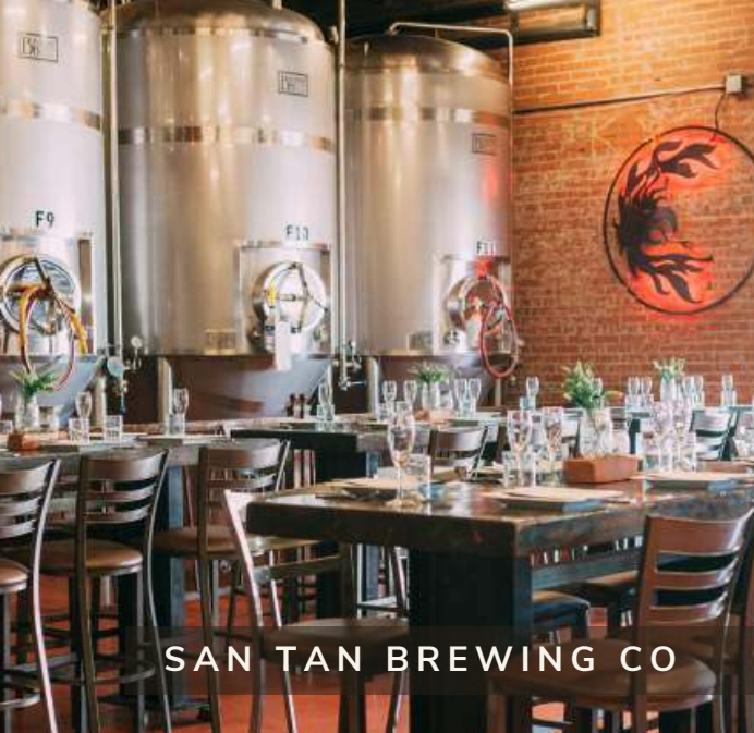
SAN TAN BREWING CO