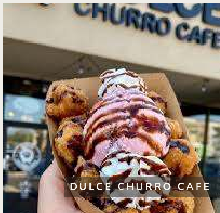
DULCE CHURRO CAFE