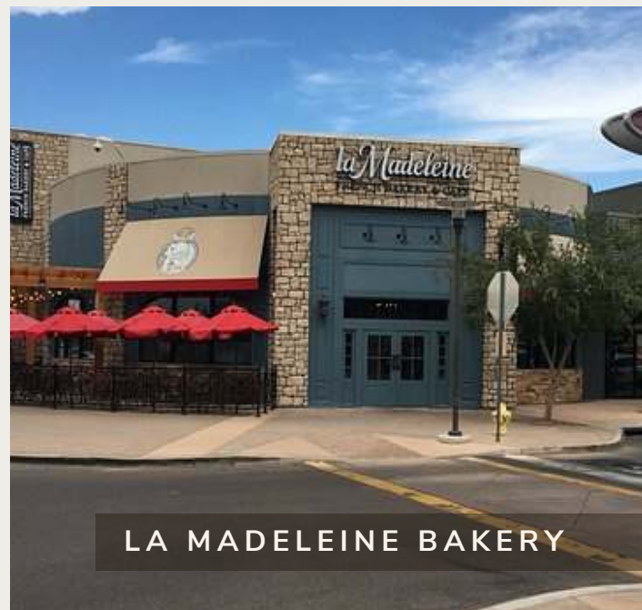
LA MADELEINE BAKERY