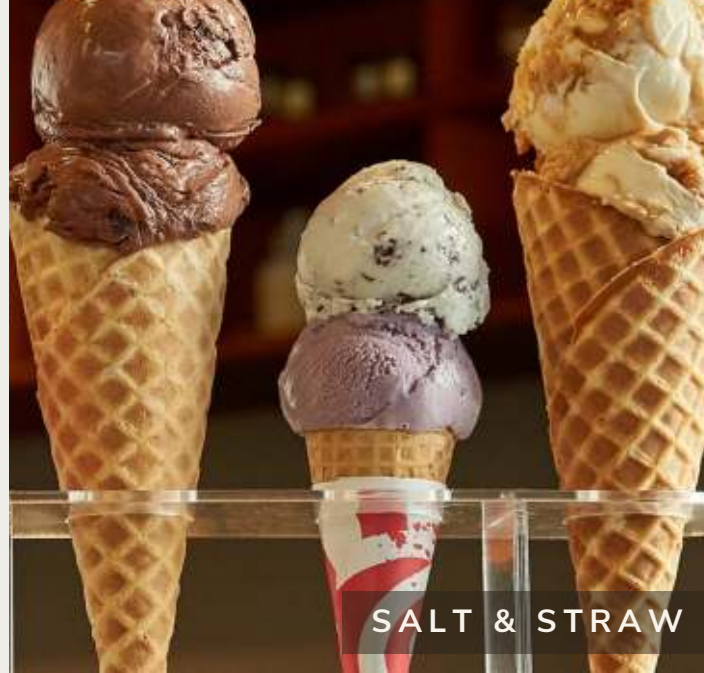
SALT & STRAW