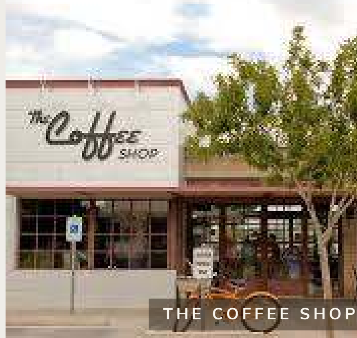
THE COFFEE SHOP