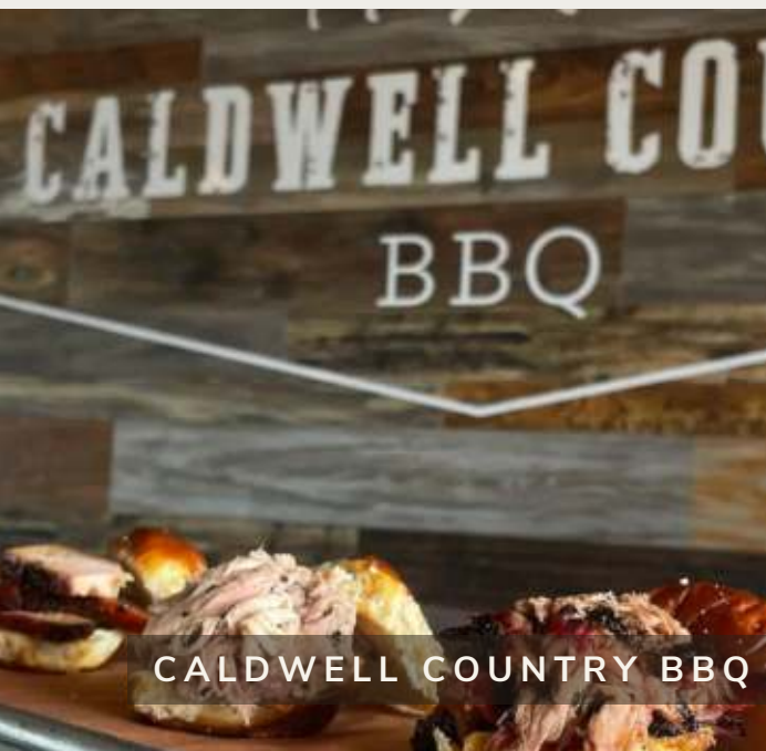
CALDWELL COUNTRY BBQ