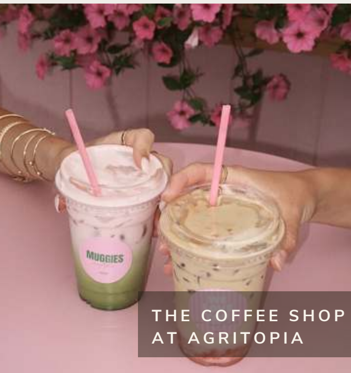
THE COFFEE SHOP AT AGRITOPIA

There's just something about starting the day with a killer class at Power Core Pilates, followed by a well-earned smoothie from Main Squeeze Juice Co. (because recovery is key!)