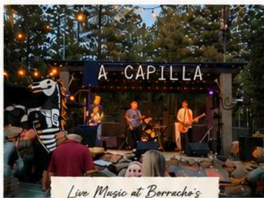
Live Music at Borracho's