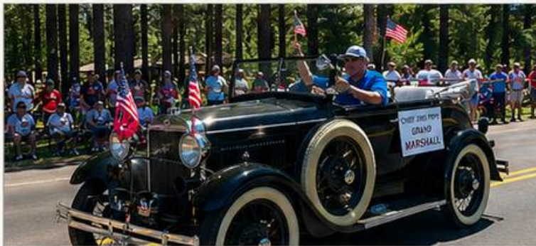
★ Leading the way with hometown pride.