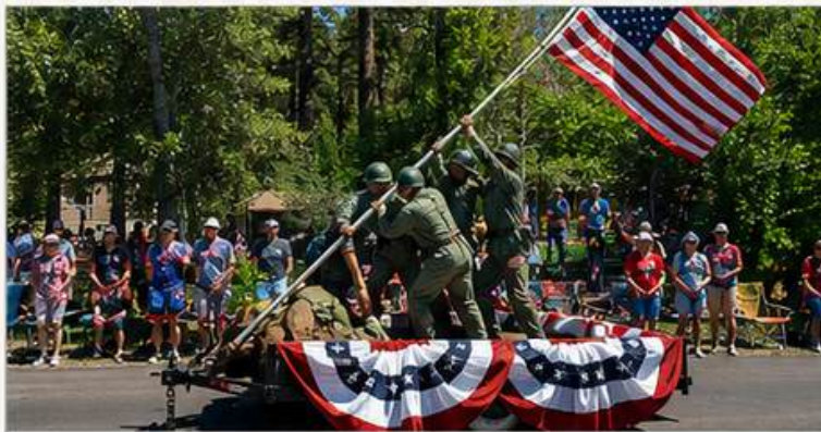
★ Honoring the brave who have served.