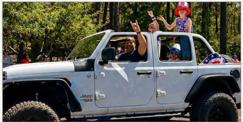
★ Families, friends and future generations.