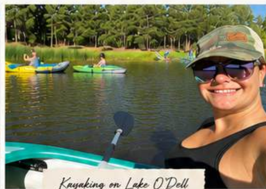
Kayaking on Lake O'Dell