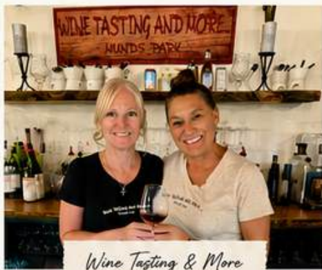
Wine Tasting & More