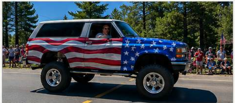
★ All decked out and showing American pride.

Without a doubt, the biggest day of the year in Munds Park is the Fourth of July .