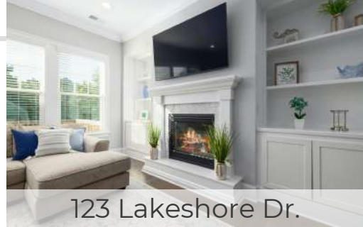
123 Lakeshore Dr.

Square Feet: 2,000 Bedrooms: 3 Baths: 2 Garage: 2 Car, attached Days on the Market: 18 Days