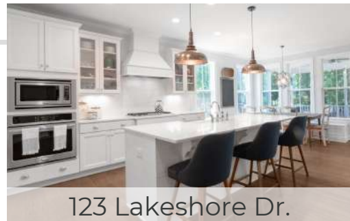
123 Lakeshore Dr.

Square Feet: 2,000 Bedrooms: 3 Baths: 2 Garage: 2 Car, attached Days on the Market: 18 Days