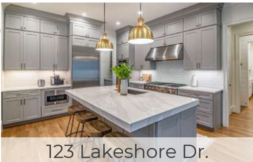
123 Lakeshore Dr.

Square Feet: 2,000 Bedrooms: 3 Baths: 2 Garage: 2 Car, attached Days on the Market: 18 Days