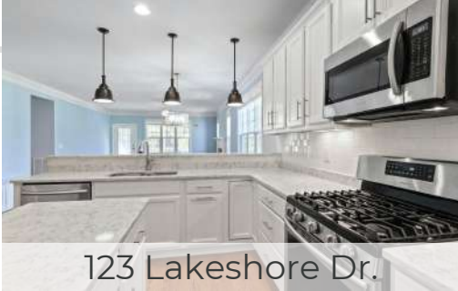
123 Lakeshore Dr.

Square Feet: 2,000 Bedrooms: 3 Baths: 2 Garage: 2 Car, attached Days on the Market: 18 Days